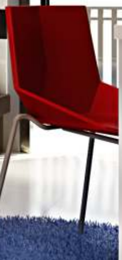
Dressed-up Unit, Artist's Perspective